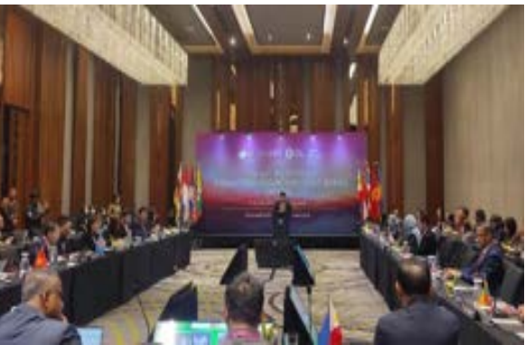
The 43rd AFSRB during 7 - 8 June 2023 in Bogor, West Java, Indonesia

2.4 The Special Senior Officials Meeting of the 44<sup>th</sup> Meeting of the ASEAN Ministers on Agriculture and Forestry (SSOM-44<sup>th</sup> AMAF) and the Special Senior Officials Meeting of the 22<sup>nd</sup> Meeting of the ASEAN Ministers on Agriculture and Forestry Plus Three (SSOM-22<sup>nd</sup> AMAF+3)