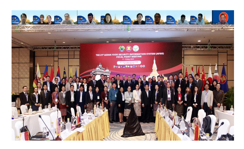
The 21st AFSIS Focal Point Meeting on 17 - 18 May 2023 as a hybrid meeting