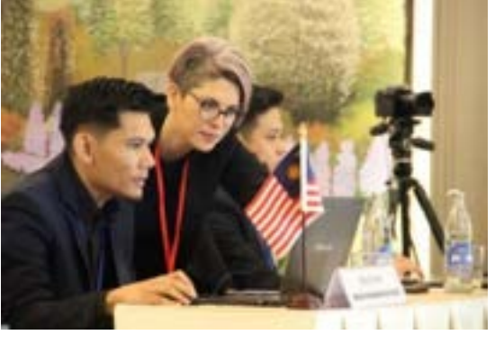
The 2<sup>nd</sup> Regional Workshop on the SAFER Project during 12 – 13 December 2023 in Bangkok, Thailand