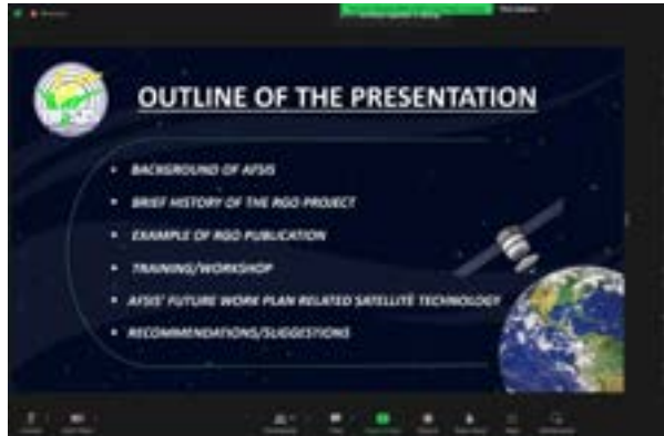
PPFS Webinar on Digitalization and Innovation of APEC Food System on 5 December 2023 in ROK