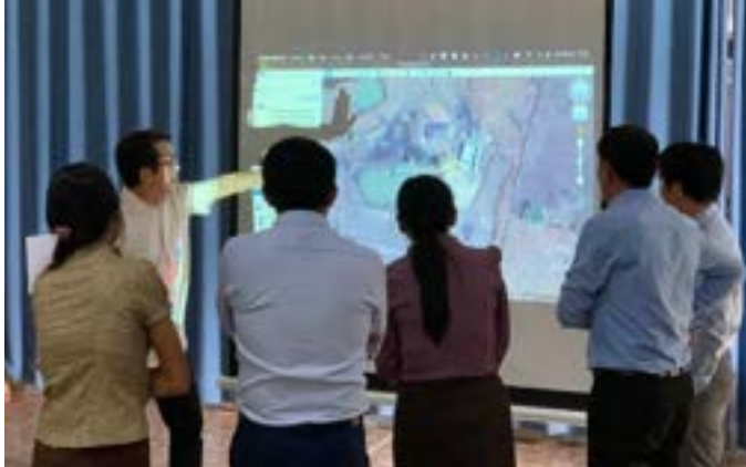
INAHOR Workshop in Vang Vieng, Lao PDR during 31 July – 1 August 2023