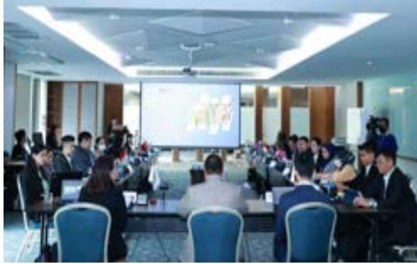
The 1<sup>st</sup> Regional Workshop on the SAFER Project during 29 – 30 August 2023 in Bangkok, Thailand