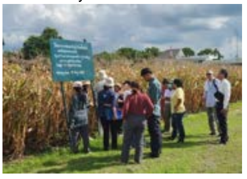
Maize Field Trip for the MGO Activity on 31 August 2023 in Lopburi and Nakhon Sawan provinces, Thailand