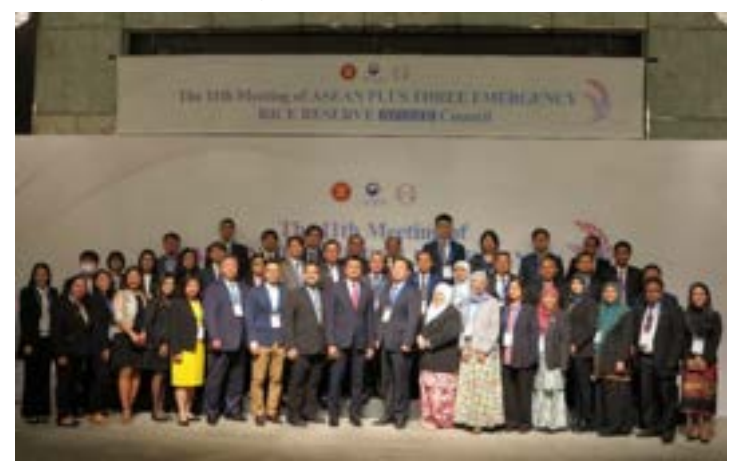
The 11th Meeting of APTERR Council during 25 - 26 April 2023 in ROK

The meeting was held during 25 - 26 April 2023 in Seoul, the Republic of Korea as a physical meeting, hosted by the ROK. The meeting was to report on the realization of the work plan and budget plan for the fiscal year 2022, the work plan, and the annual operational budget proposal for the fiscal year 2023 of the APTERR Secretariat. In addition, the proposed options for the future of AFSIS, especially to merge AFSIS with APTERR were presented and discussed in the meeting for consideration and comments. The result of this discussion was reported in the 21st AFSIS Focal Point Meeting on 17 - 18 May 2023 in Lao PDR.