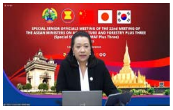
The SSOM-44<sup>th</sup> AMAF and the SSOM-22<sup>nd</sup> AMAF+3 on 22 - 23 August 2023